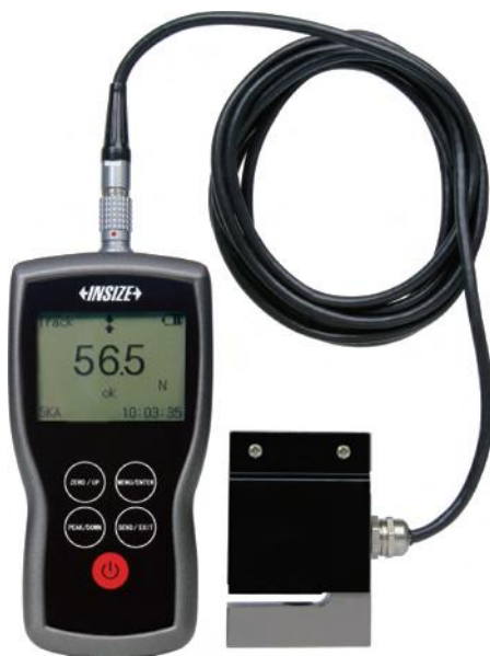
ISF-DF5KA type B