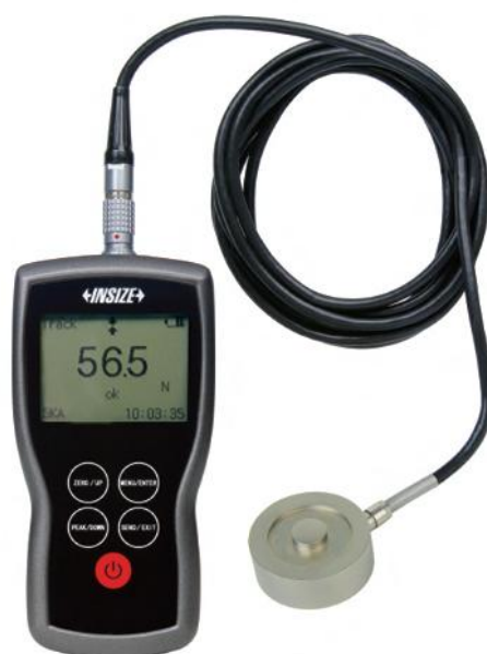
ISF-DF10KC type C