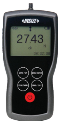
ISF-DF100A type A